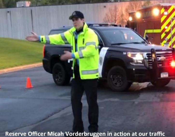
control training event.